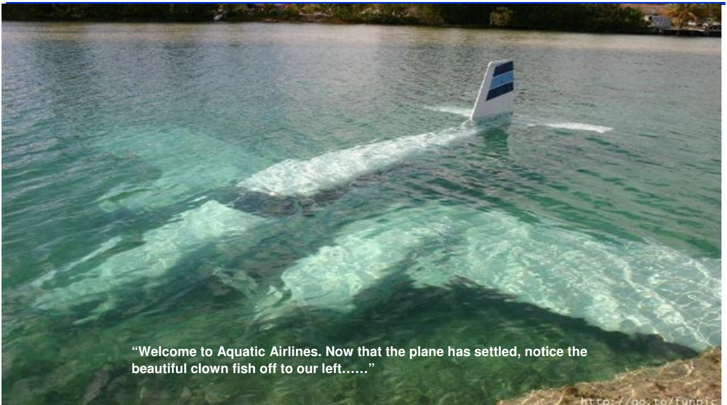
“Welcome to Aquatic Airlines. Now that the plane has settled, notice the beautiful clown fish off to our left.....”