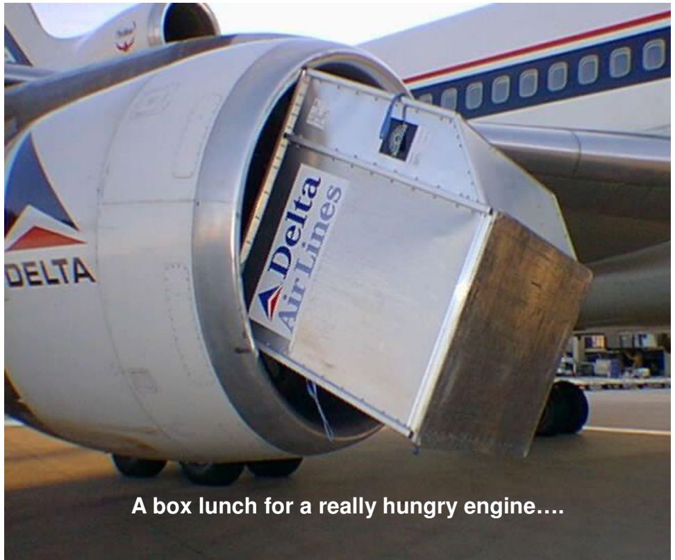
A box lunch for a really hungry engine....